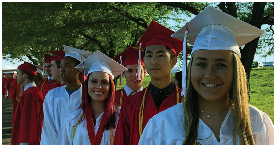
Bright smiles on the procession line as Tappan Zee High School's Class of 2019 made its entrance at the June 26 Commencement Ceremony.